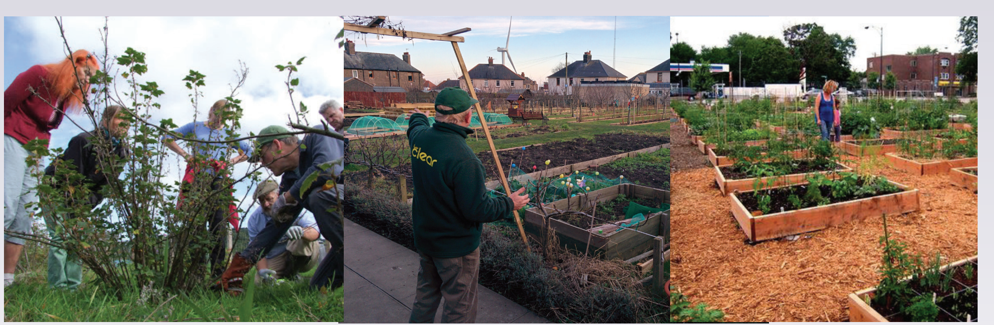
Precedent images of community gardens and activities

To create Community Growing Spaces / productive landscapes