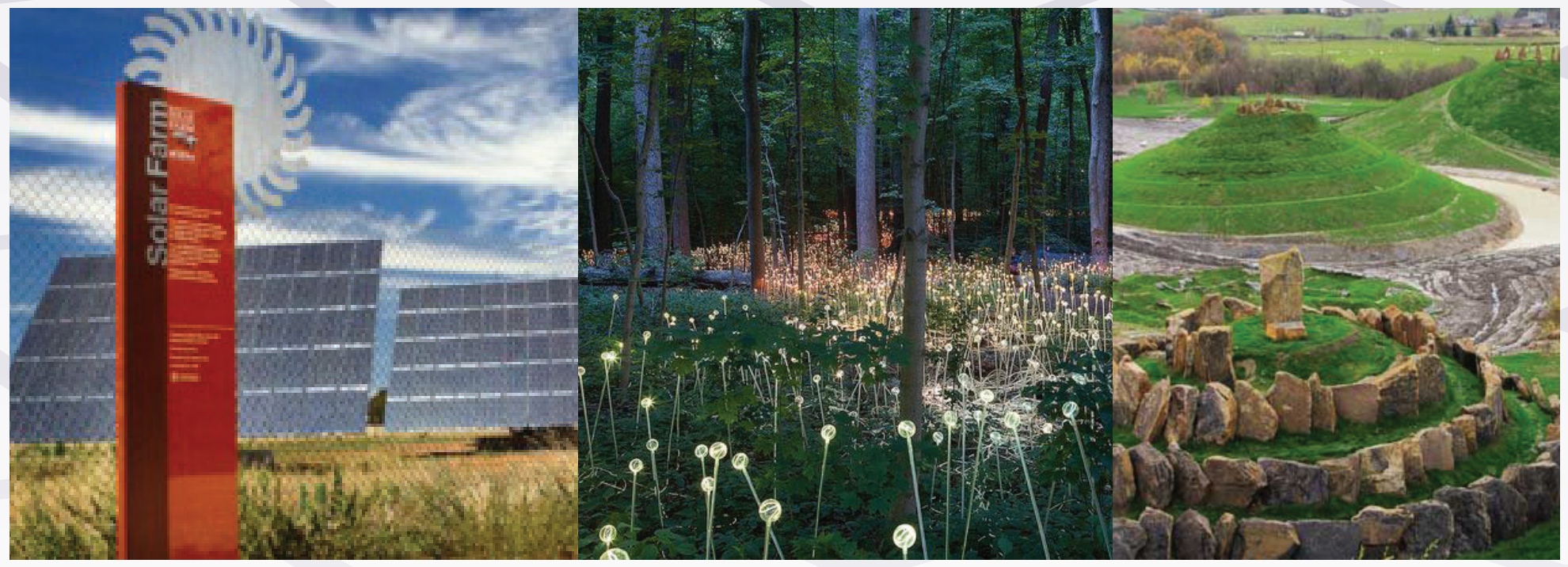
Before and after images of proposed Rising Sun Trails park incorporating renewable energy structures in artistic and visually engaging forms, new entrance gateways and walls

Opportunities / Key Players Fife Council / CLEAR