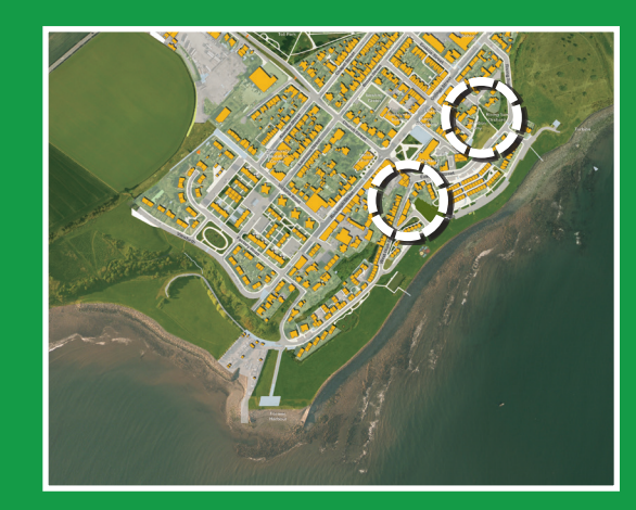
Improve existing connections between the town centre and foreshore and link in to the creation of a town circuit and coastline orbital path.