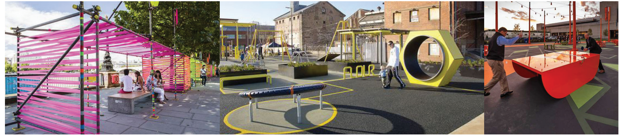
Precedent images of the type of potential temporary installation and play equipment that could be introduced within the estate space, adding colour, diversity of use and a much needed alternative activity area for the town