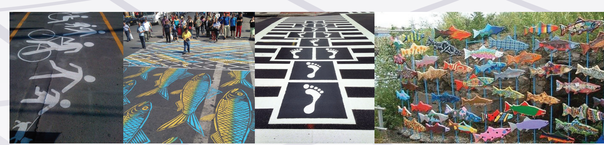
Exemplar images of safer routes to school markings, alternative graphics for road crossings and possible artworks from historical reference

To activate the school, inside and outside, improve connections with the town centre and create CLEAR safer routes to school. Proposed measures will also identify and reinforce approach in to town along College Street.