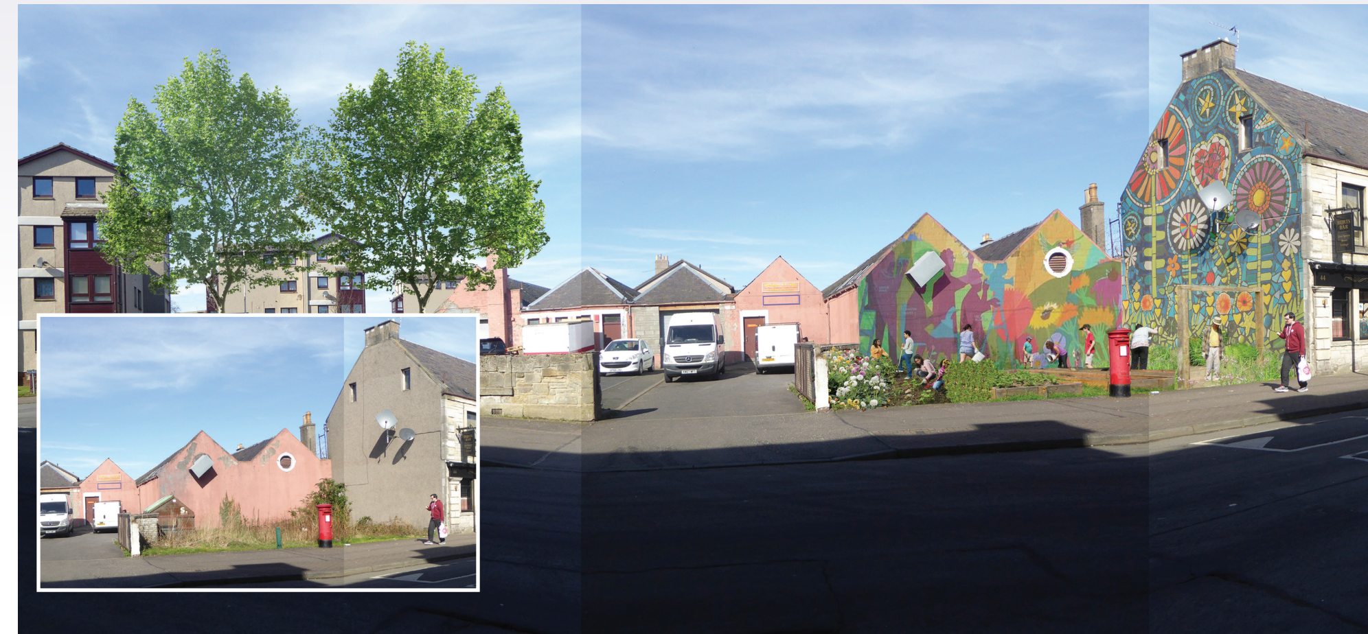
Before and after images of showing community garden improvements on waste ground next to Bert's Bar