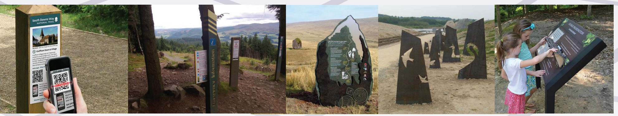
Wayfinding routes and signage to include local references - 'Try a Stuart's Pie' - 'Pick an apple and marvel at the coastal views' - 'Wander along an unspoilt coast untroubled by other visitors with great views out to sea' - 'Buy an award winning pie or Irn Bru sausages' at our 3 butchers' - or 'Look for the Secret Orchards'.

To provide improved pedestrian and cycling routes / circuits around the town, and better connections with the Fife Coastal Path, Pilgram's Way and the Core Path Network.